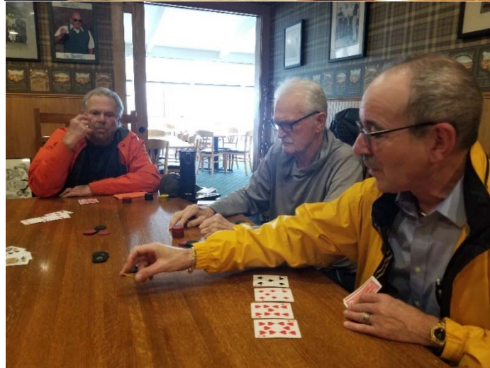
Submitted by Wally Holmes