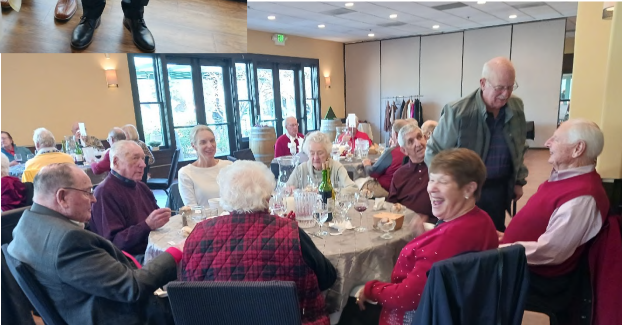
Table 2 Bettega Dean Fogh Morrison Stein